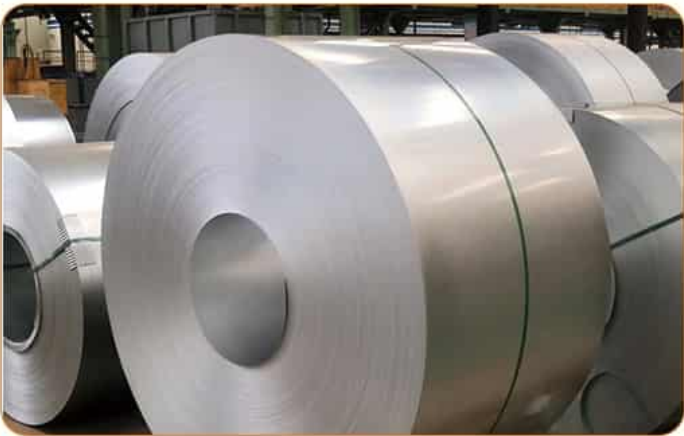
1.彩涂基板 Basic plate of PPGL

镀铝锌板，具有良好的耐腐蚀性和延展性，有利于深加工等特点。主要用于建筑、汽车、交通及家电等领域，特别是钢结构建筑等行业。 According to the high performance characteristics of corrosion resistance and eoxtensibility as well as excellent further processing, GL is mainly adopted for construction vehicle, transportation and household appliances,especially for the steel structure construction and relative fields.