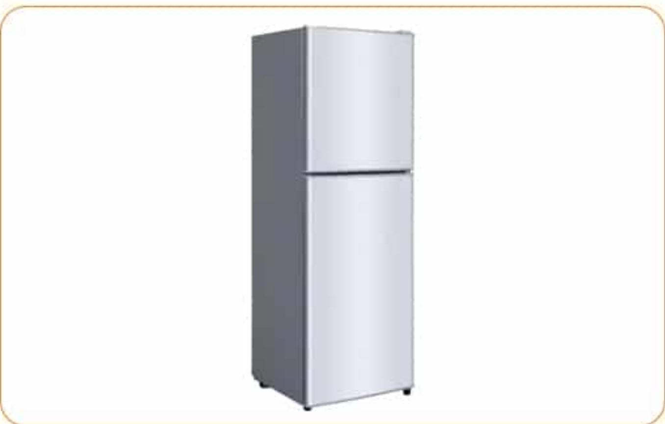
2.建筑板、民用家电板 Constructions and civil usage for household appliances such as ventilation pipe,piping coating and washing machine.oven.